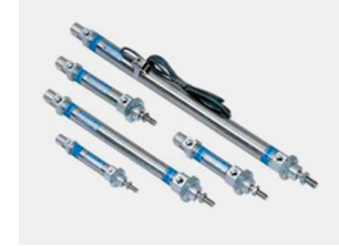
Pencil type cylinders