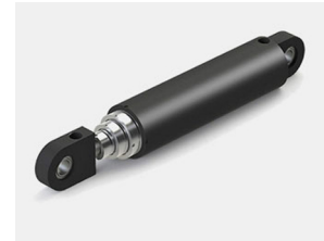
Very High pressure type cylinders