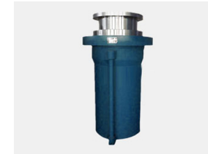
Large bore type cylinders