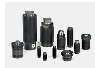
Full Threaded type cylinders