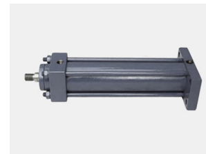
Bottom mounting cylinders