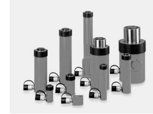
Bottle type cylinders