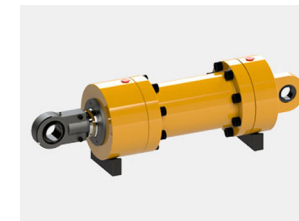
Heavy duty bolted types cylinders