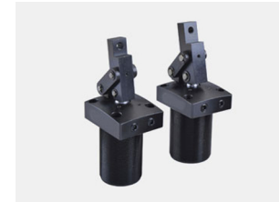
Hinged type cylinders