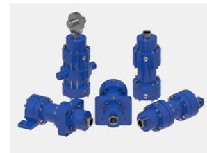
Mill Type cylinders